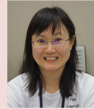
Ching Ching Ong National University Hospital / Singapore